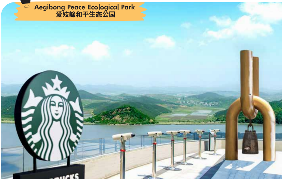
Aegibong Peace Ecological Park 爱妓峰和平生态公园