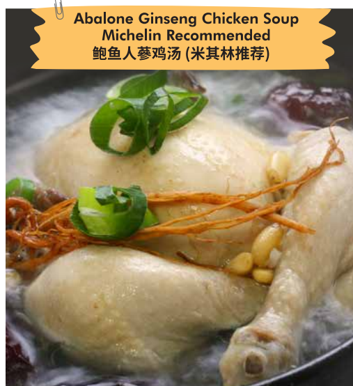
Abalone Ginseng Chicken Soup Michelin Recommended 鲍鱼人蔘鸡汤 (米其林推荐)