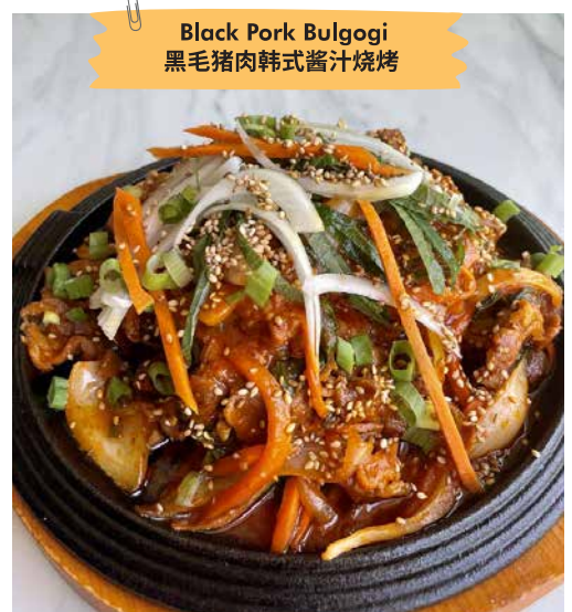
Black Pork Bulgogi 黑毛猪肉韩式酱汁烧烤