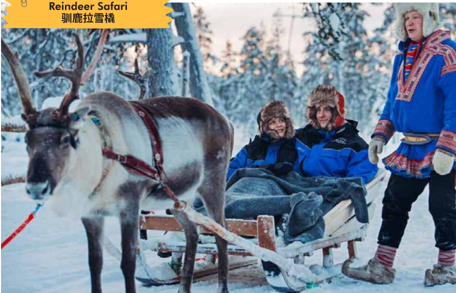
Reindeer Safari 驯鹿拉雪橇