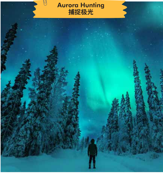
Aurora Hunting 捕捉极光