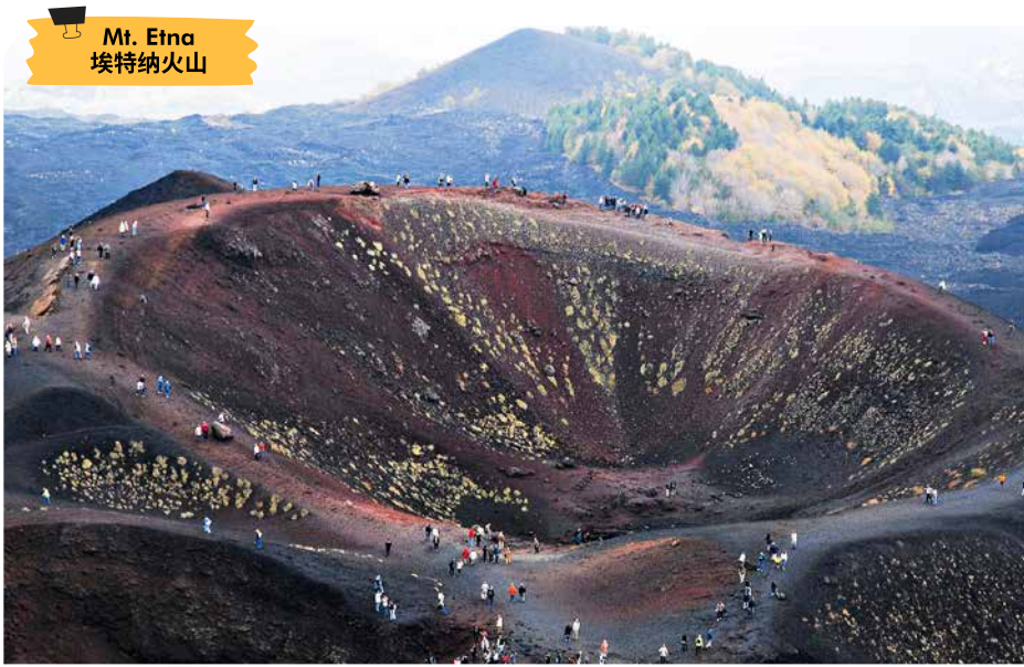
Mt. Etna 埃特纳火山