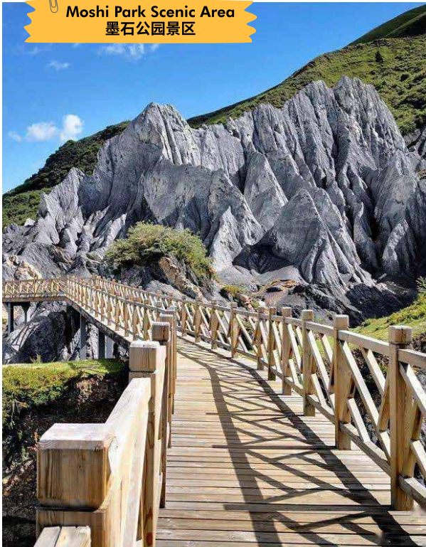
Moshi Park Scenic Area 墨石公园景区