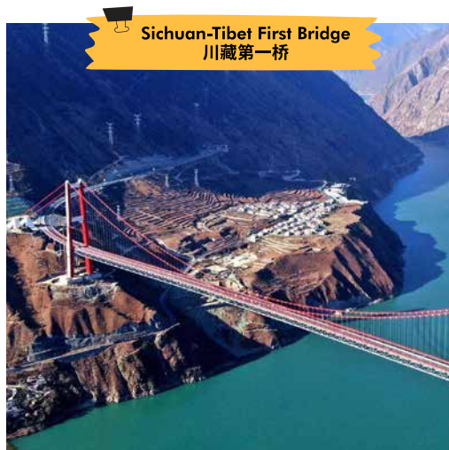
Sichuan-Tibet First Bridge 川藏第一桥