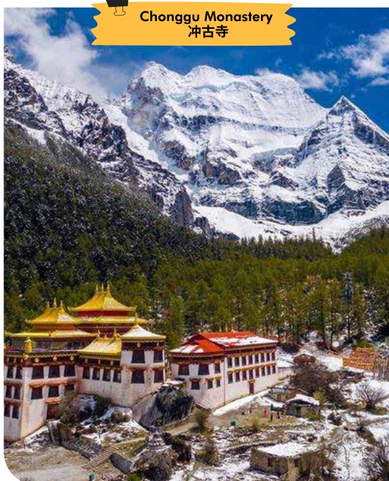
Chonggu Monastery 冲古寺