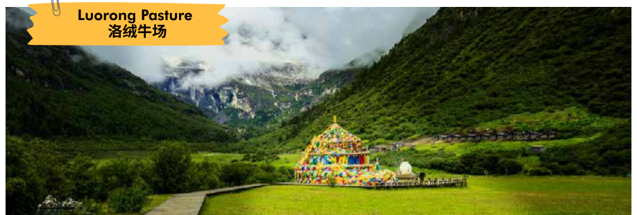
Luorong Pasture 洛绒牛场