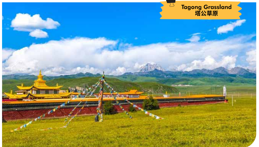
Tagong Grassland 塔公草原