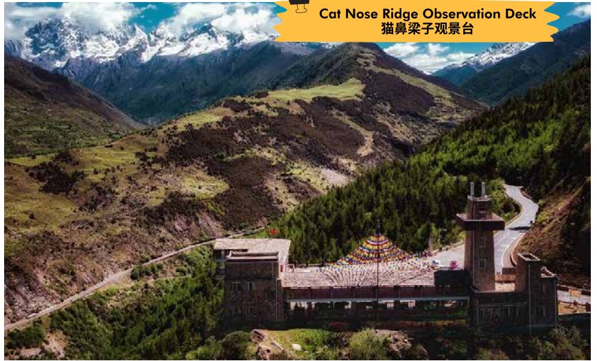
Cat Nose Ridge Observation Deck 猫鼻梁子观景台