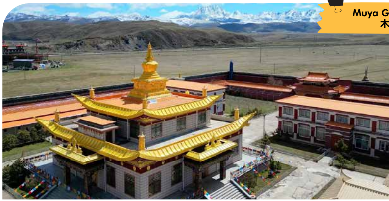
Muya Golden Tower 木雅金塔