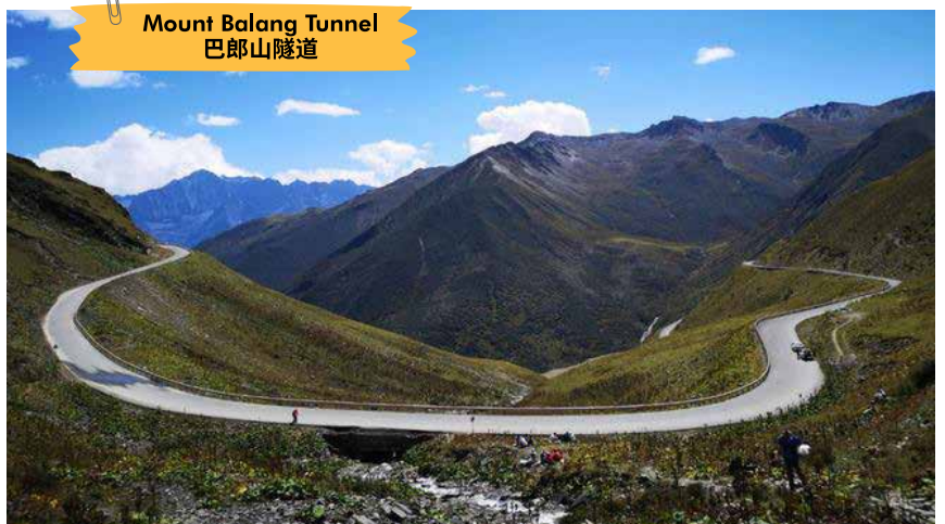
Mount Balang Tunnel 巴郎山隧道