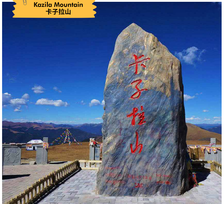
Kazila Mountain 卡子拉山