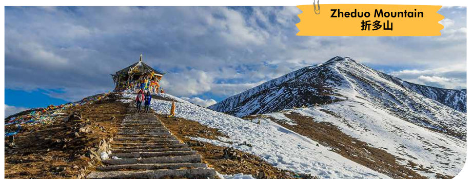
Zheduo Mountain 折多山