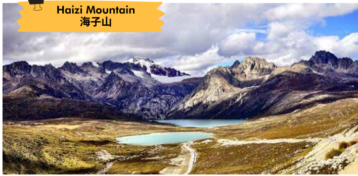
Haizi Mountain 海子山