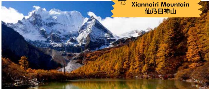
Xiannairi Mountain 仙乃日神山