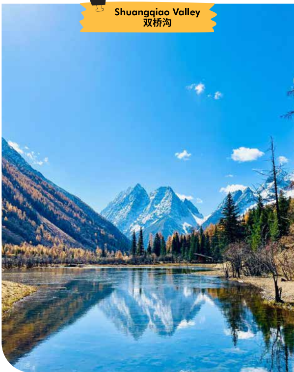
Shuangqiao Valley 双桥沟