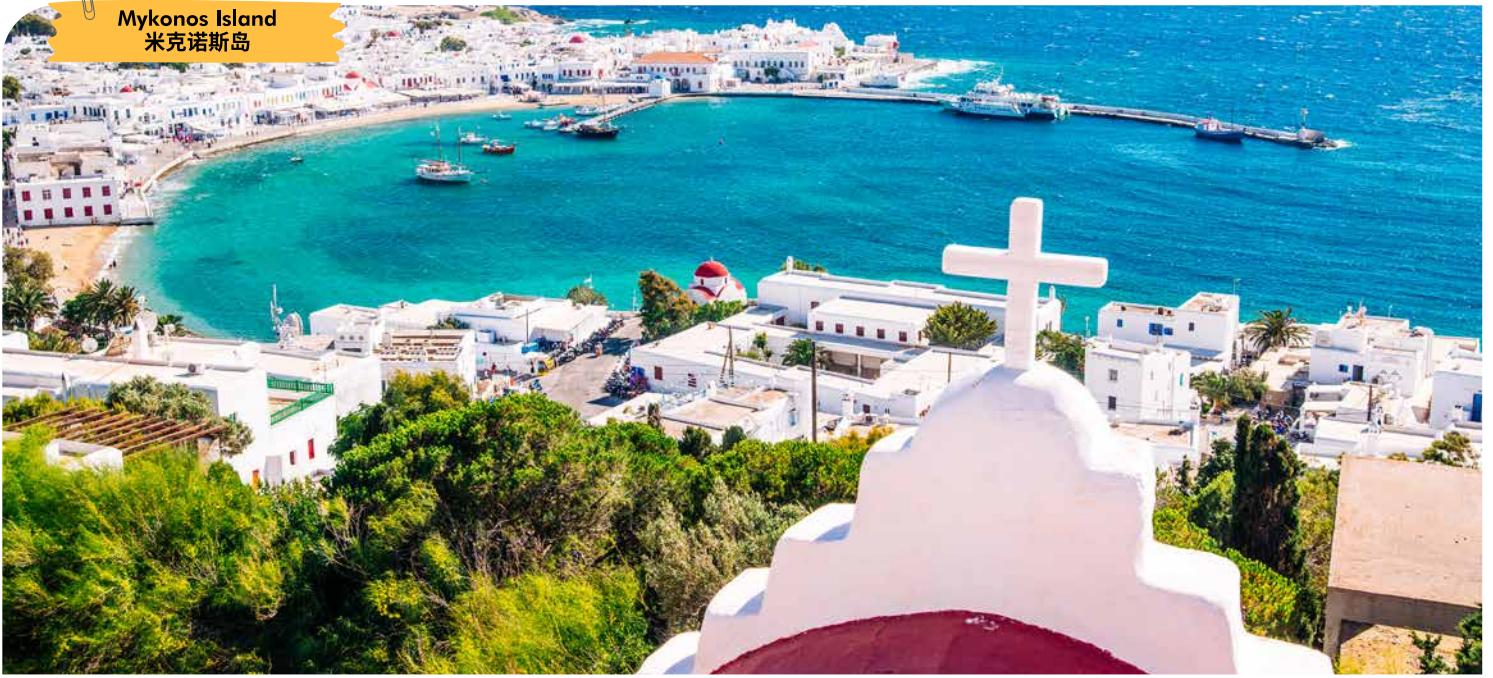
Mykonos Island 米克诺斯岛