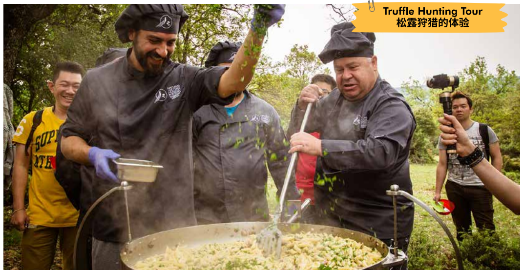
Truffle Hunting Tour 松露狩猎的体验