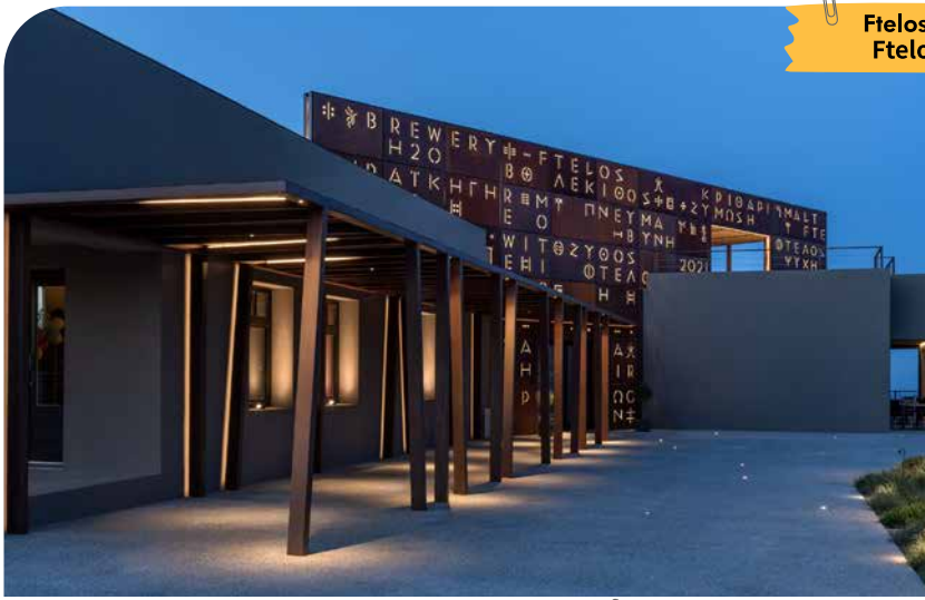
Ftelos Brewery Ftelos 啤酒厂