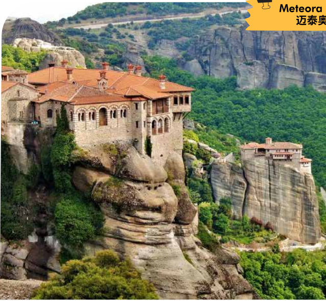
Meteora Monasteries 迈泰奥拉修道院