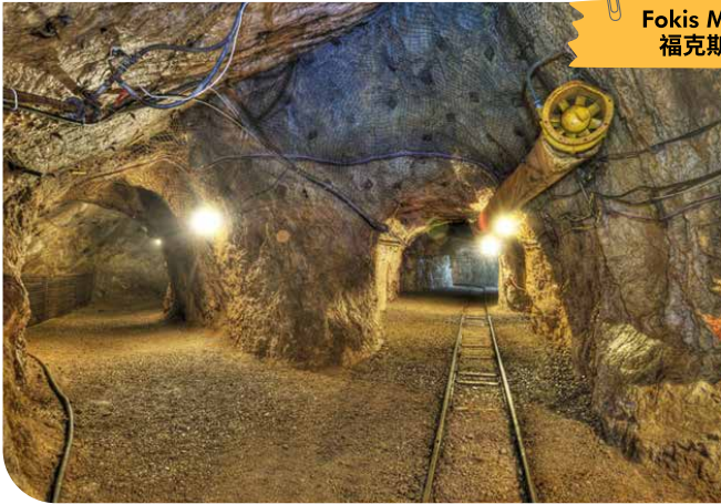
Fokis Mining Park 福克斯矿业公园