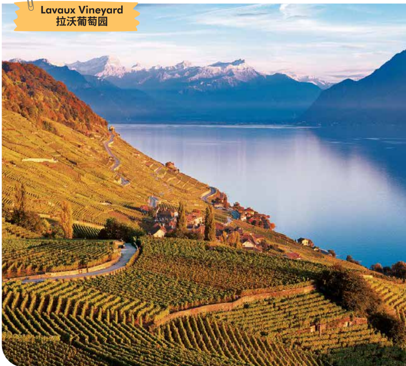
Lavaux Vineyard 拉沃葡萄园