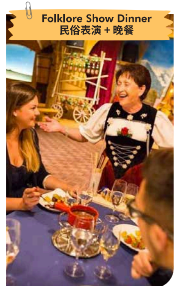
Folklore Show Dinner 民俗表演+晚餐