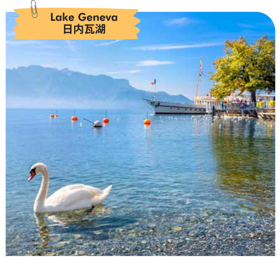
Lake Geneva 日内瓦湖