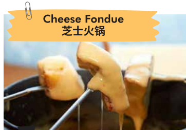
Cheese Fondue 芝士火锅