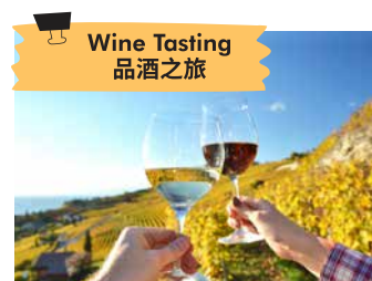
Wine Tasting 品酒之旅