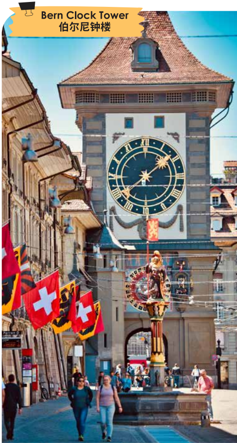
Bern Clock Tower 伯尔尼钟楼