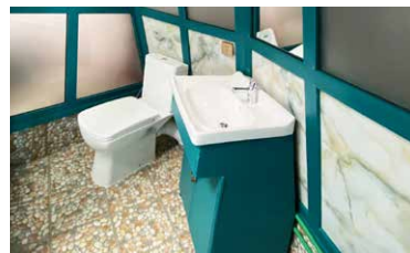
附设卫生间 Attached Toilet