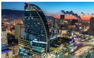
乌兰巴托市区 Ulanbaatar City