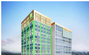
Holiday Inn Hotel