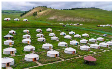
草原蒙古包 Grassland Ger Camp