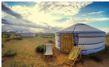
户外景观 Outdoor view