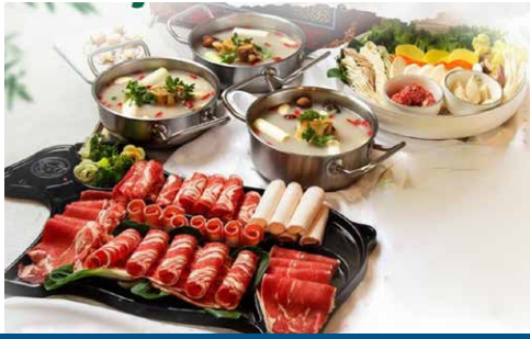
小肥羊火锅 Little Sheep Hotpot