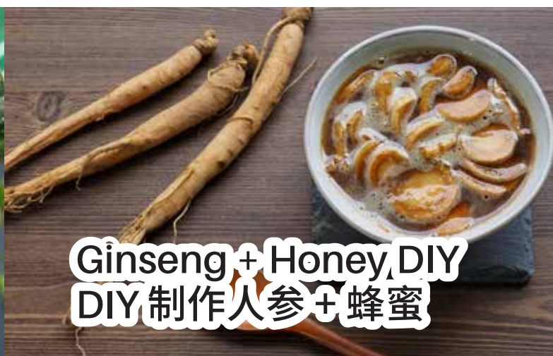
Ginseng + Honey DIY DIY 制作人参+蜂蜜