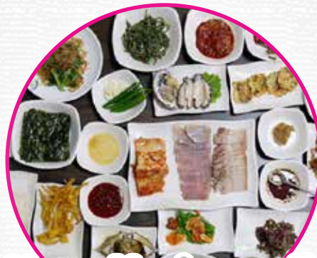
Korea Hanjeongsik 韩定食