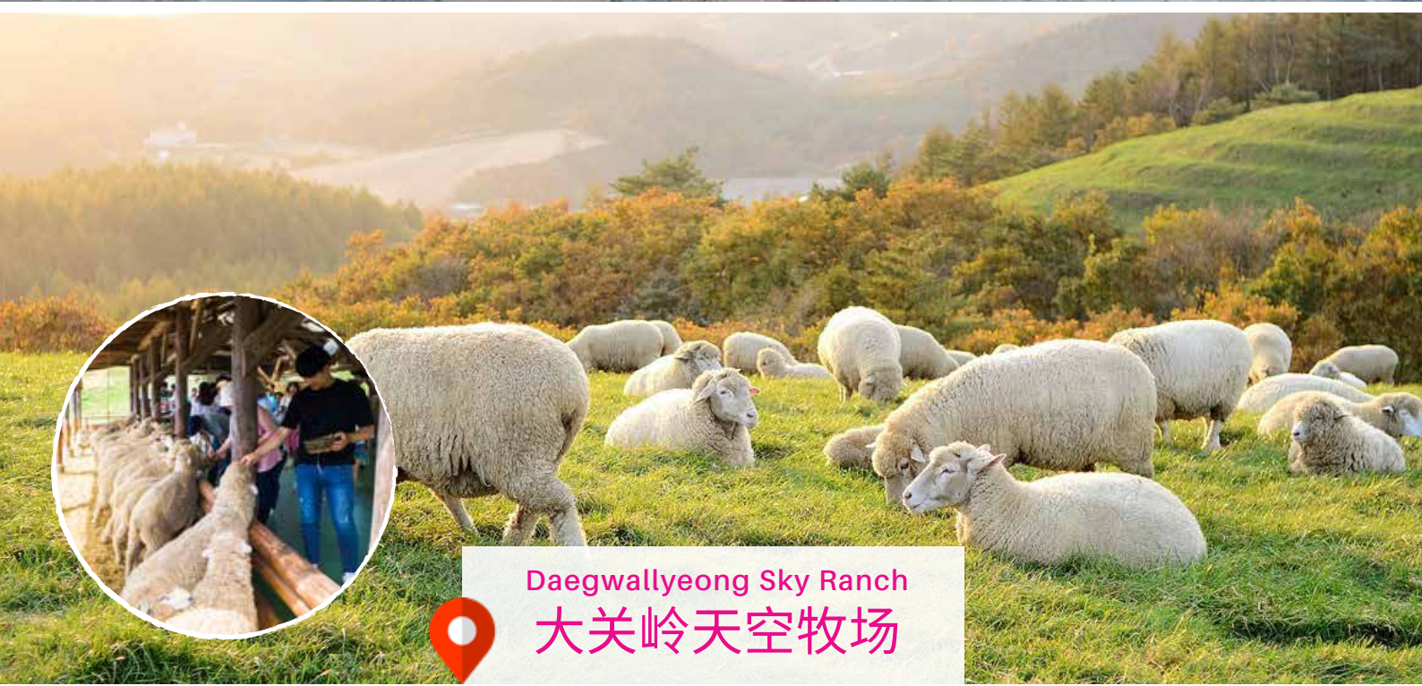
Daegwallyeong Sky Ranch 大关岭天空牧场