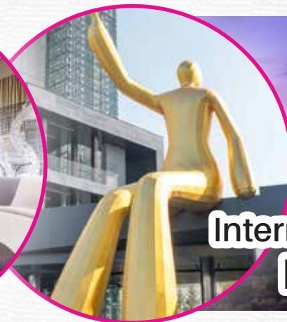
International 5 Star Yongsan Novotel 国际5星龙山诺富特大使酒店

* Picture shown are for illustration purpose only * 照片仅供参考