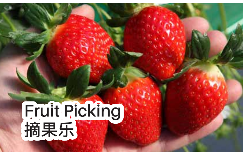
Fruit Picking 摘果乐