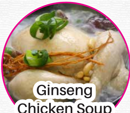
Ginseng Chicken Soup 人参炖鸡汤