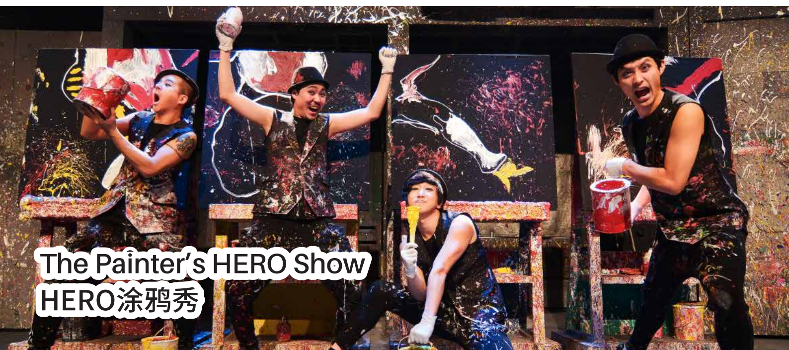
The Painter's HERO Show HERO涂鸦秀