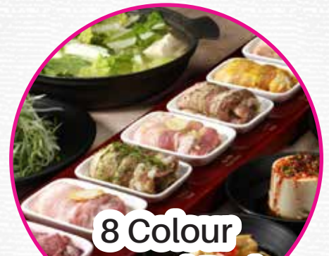
8 Colour Samgyeopsal Barbeque 特色八色烤肉

* Picture shown are for illustration purpose only * 照片仅供参考