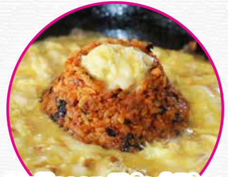
Hallasan Fried Rice 汉拿山炒饭