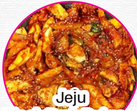
Jeju Black Pork Bulgogi 济州黑毛猪酱汁烧烤