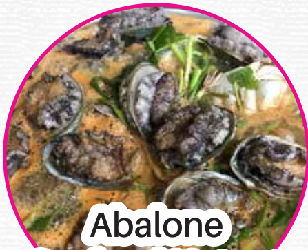
Abalone Seafood Hotpot 鲍鱼海鲜火锅