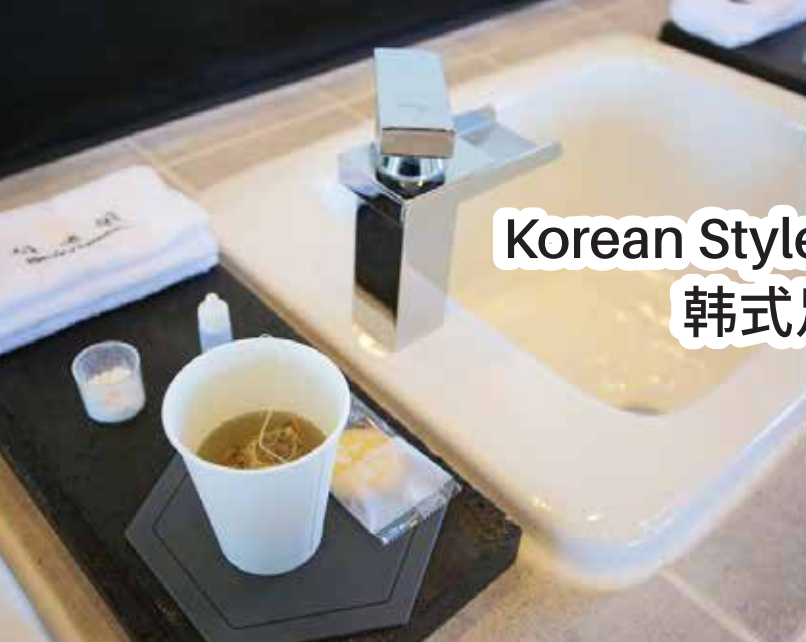
Korean Style Foot Bath 韩式足浴