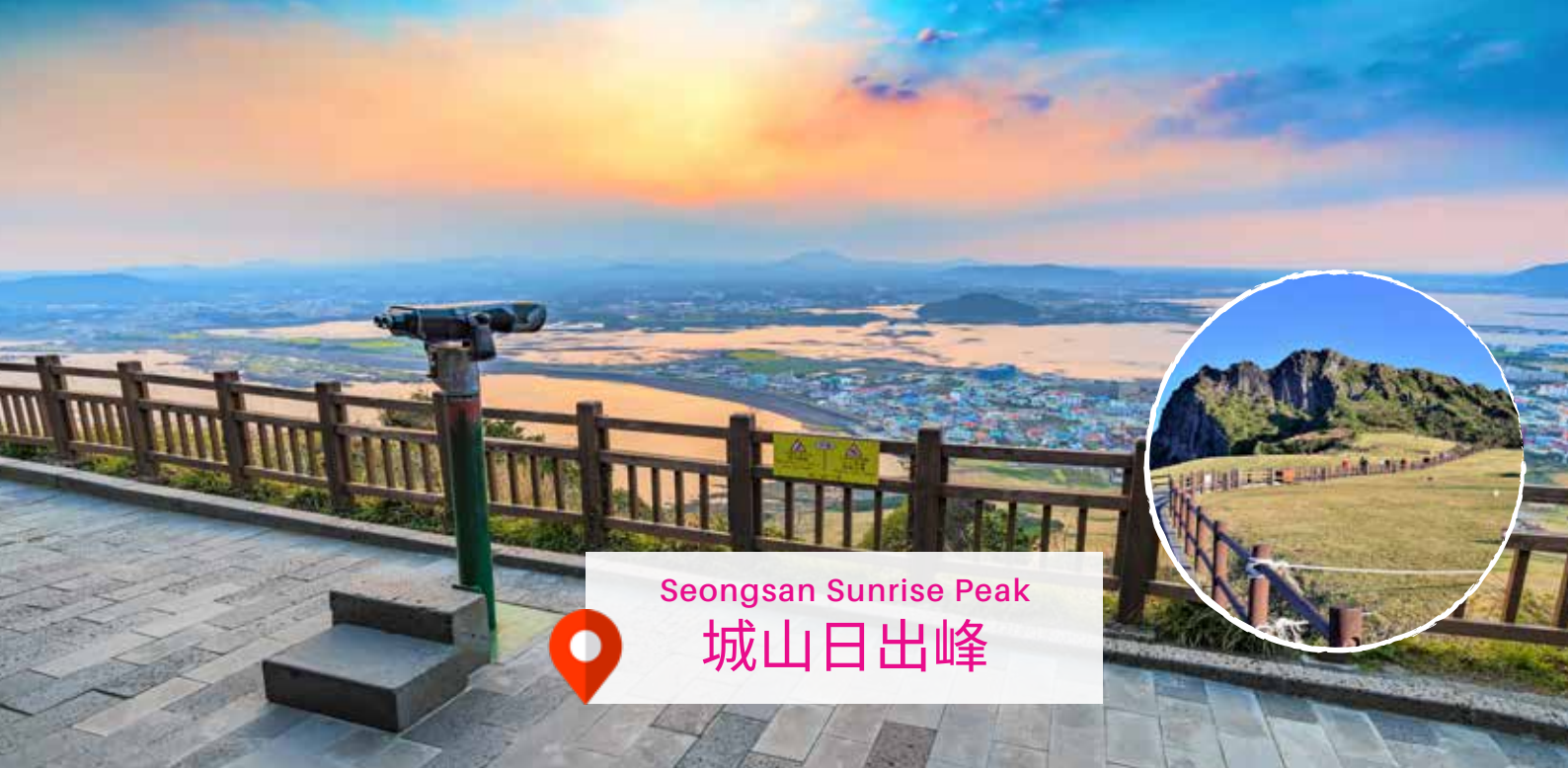
Seongsan Sunrise Peak 城山日出峰