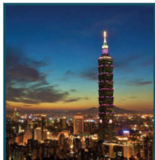
DAY 1 | 第一天